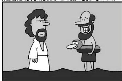
(See Matthew 14:21-33) 02-06-1998 PETER'S EARLY ATTEMPTS TO WALK ON WATER WITH JESUS DISPLAYED AN INADEQUATE AMOUNT OF FAITH